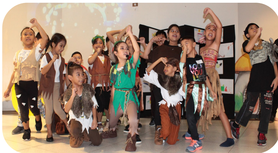
The Kids-participants acting prowess acquired in the workshop rendered during their graduation day.

These kids really worked well to improve and perfect their craft, no wonder, they could be one of the excellent dancers of this generation.