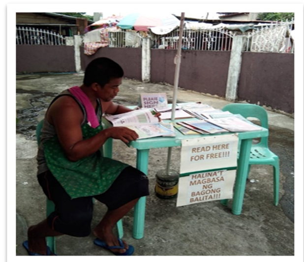
A Talipapa vendor reading newspaper at the Periodical Services Extension

Bilang pagbibigay pugay sa mga pamana sa panitikan na iniwan ni Dr. Bautista, nagbigay ng kautusan si Mayor Bautista sa Quezon City Public Library na maglaan ng isang espesyal na lugar kung saan pwedeng ipakita sa publiko ang mga kahanga hangang akda ni Dr. Bautista noong siya ay nabubuhay pa. Sa katunayan, si Si Dr. Cirilo F. Bautista ang nagsulat ng paunang salita sa aklat na inilimbag ng QCPL na may pamagat na “Lessons and Legacies: 50 Selected Speeches of Mayor Herbert M. Bautista” vol. 1. Maaaring makita ang espesyal na lugar na ito sa loob ng Filipiniana Section kung saan tinatanghal hindi lang aklat pati na rin mga artikulo at talambuhay ng isang ulirang alagad ng sining at mamamayan ng Lungsod Quezon na si Dr. Cirilo F. Bautista.