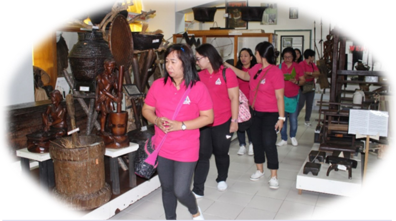
Quezon City Public Library personnel touring the SLU Museum