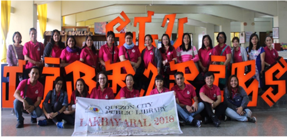
the Quezon City Public Library personnel on a group photo at the Reference Section of the SLU Library