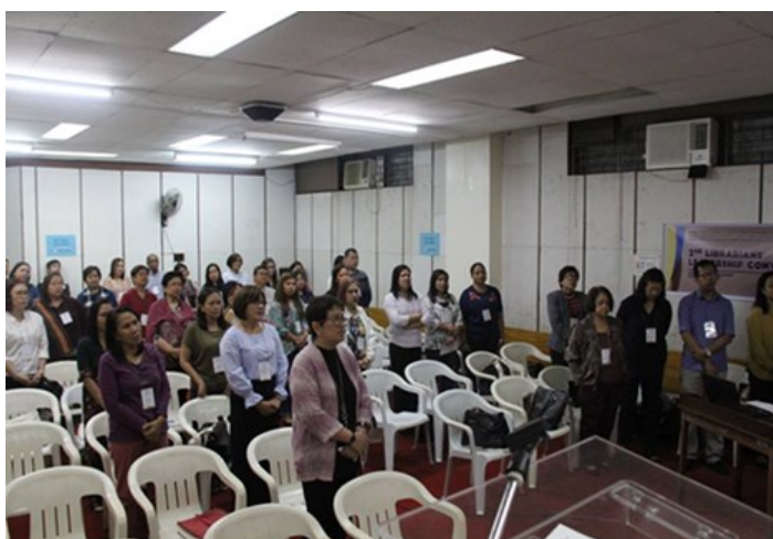
The Librarian-participants during the opening Ceremony.