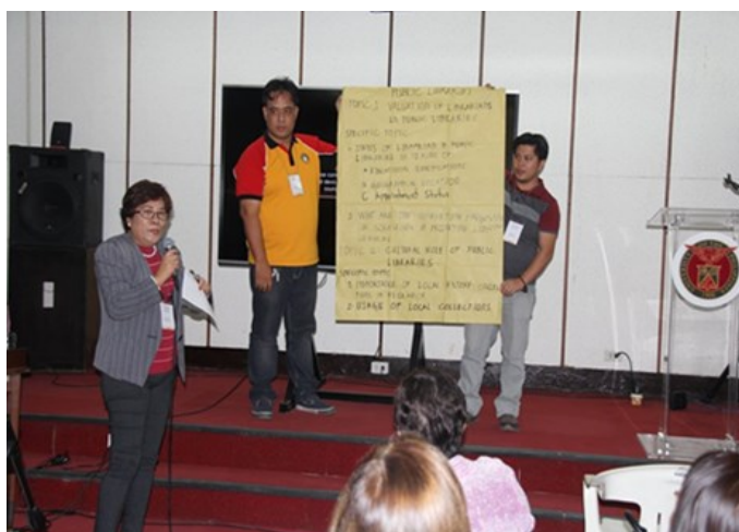
Presentation of outputs during the workshop proper