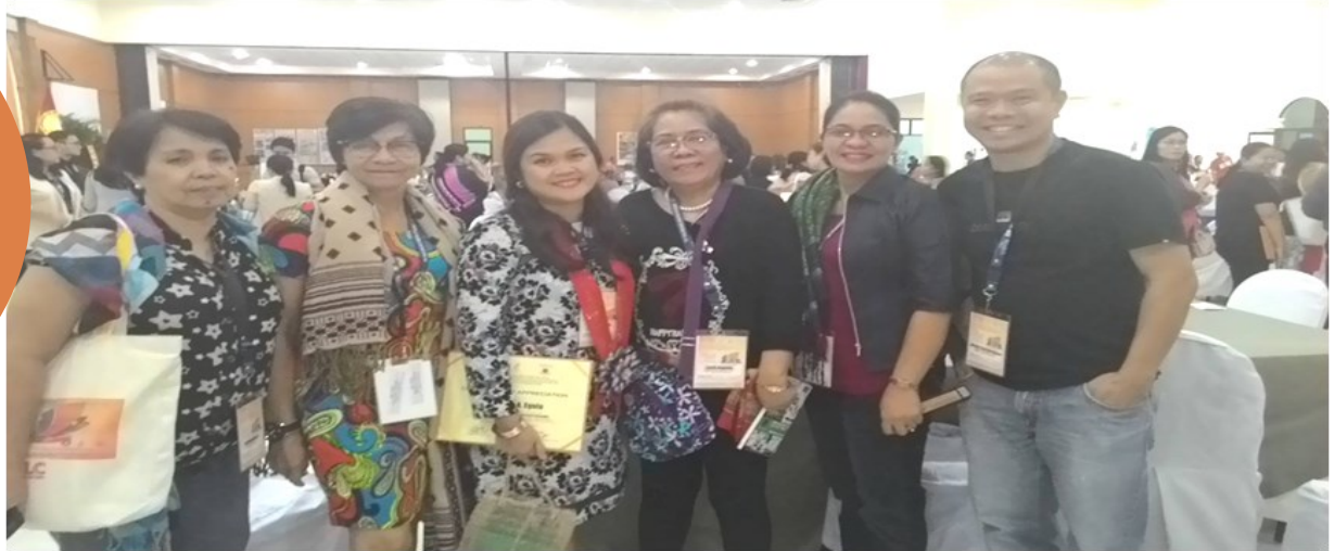
Continuation from page 10...PLAI CONGRESS