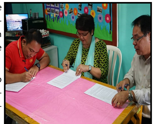
Signing of Memorandum of Agreement

The said affair aims to reach-out the people with disabilities within the community as mandated by the Republic Act No. 10070.