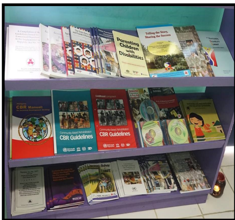
Books for our beloved PWD Readers

The said affair aims to reach-out the people with disabilities within the community as mandated by the Republic Act No. 10070.