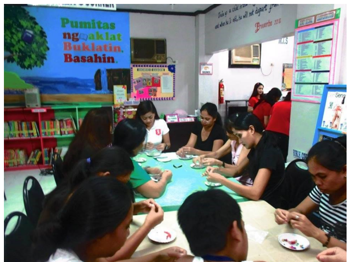
Some of the delegates applying what they've learned in making jewelries.