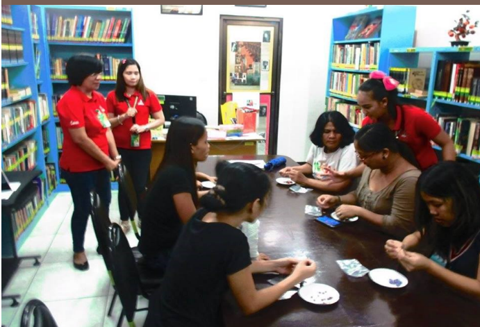
Few of our supportive librarians busy teaching our delegates