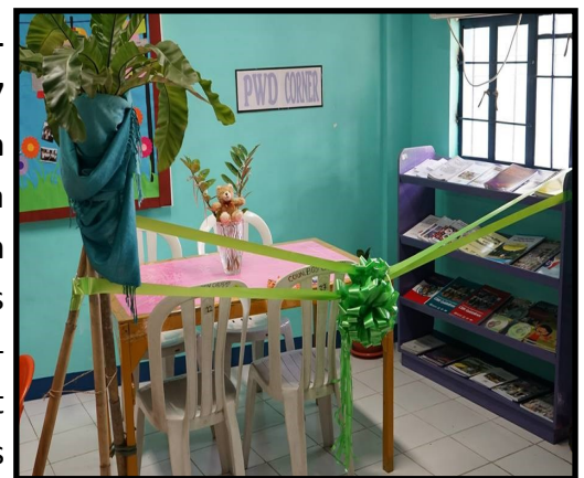
The Newly Launched PWD Corner