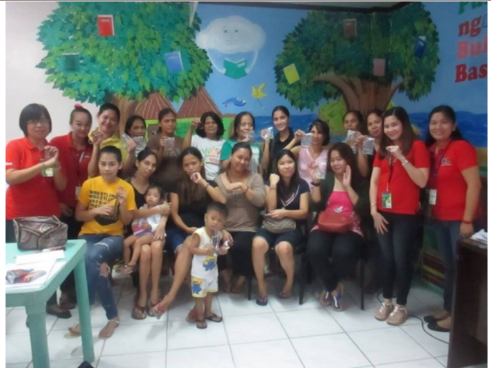
Delegates were jubilant in learning something new and profitable