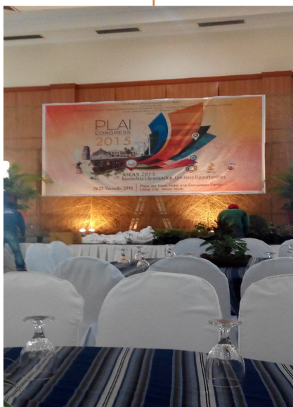
The congress tarpaulin