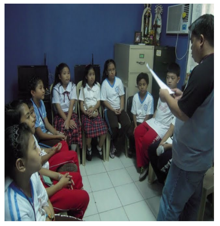
Proj. 8 Branch Library Orientation Activity