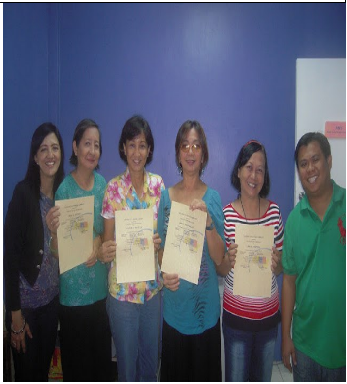
Graduates of Computer Tutorials and storytelling & Riddles at Proj. 8 Branch