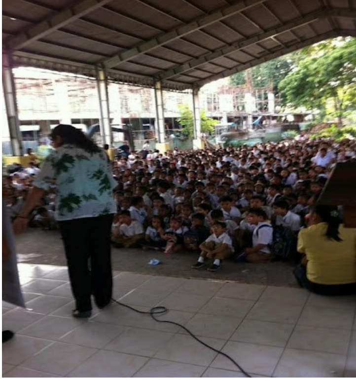
Library Orientation to the Roxas Elementary School Pupils