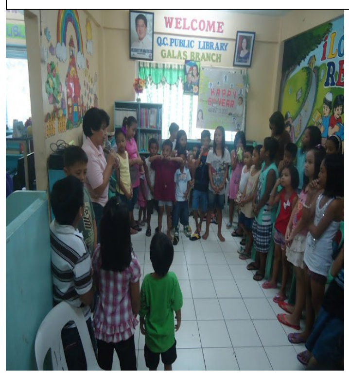
6th Year Anniversary of Galas Branch