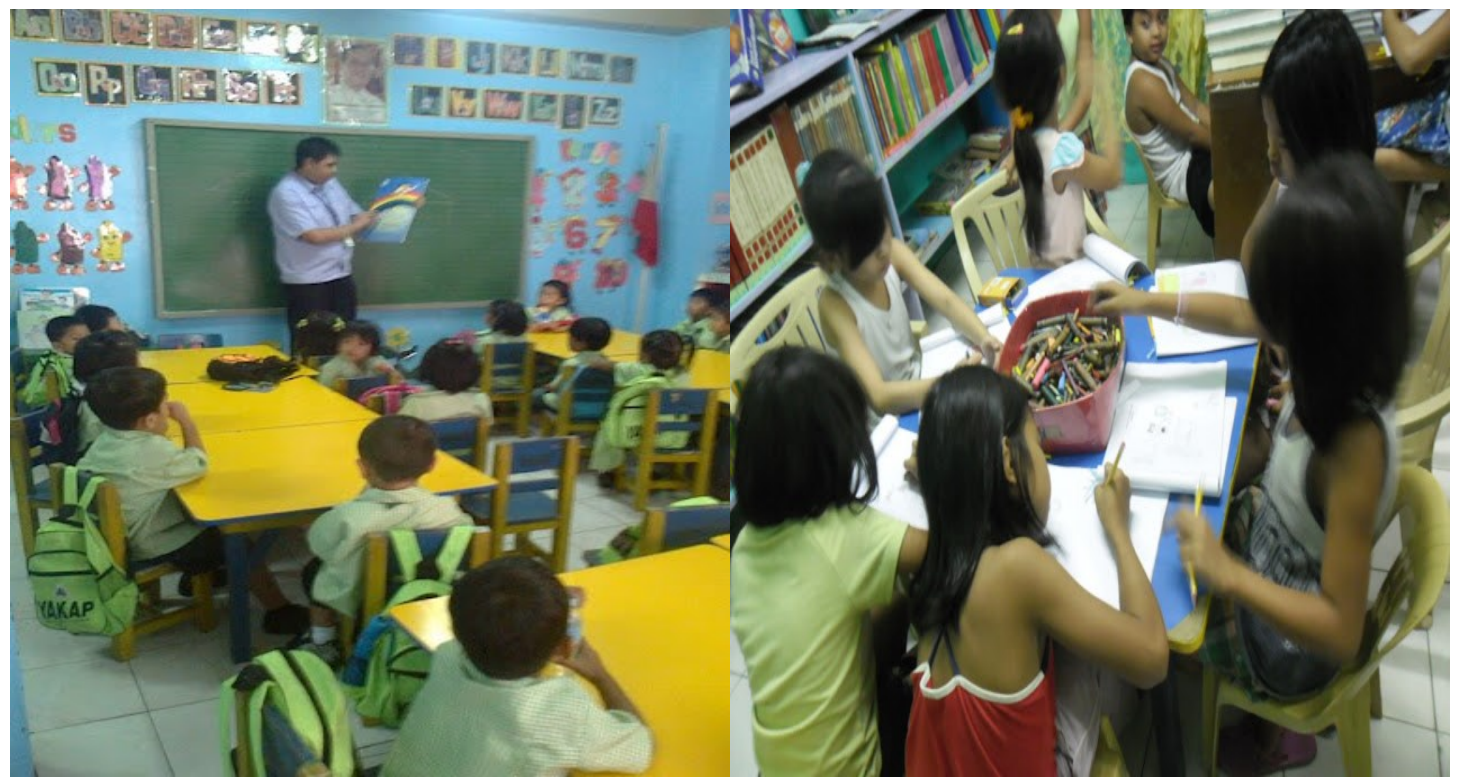
Storytelling with Yakap Day Care Pupils