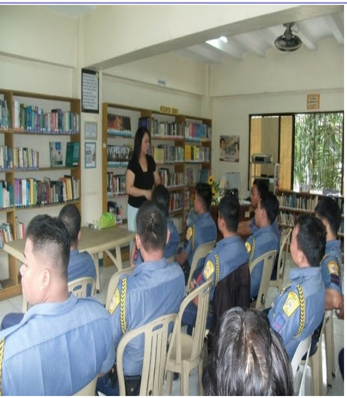
Health Awareness Lecture of QCPD at GP4L