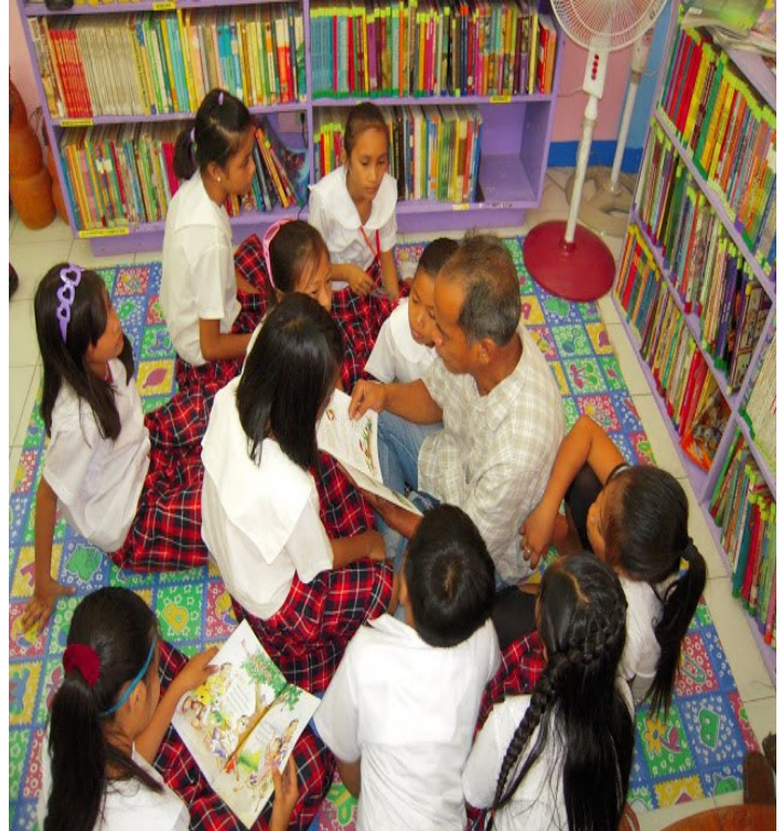
Storytelling at Project 8 Branch