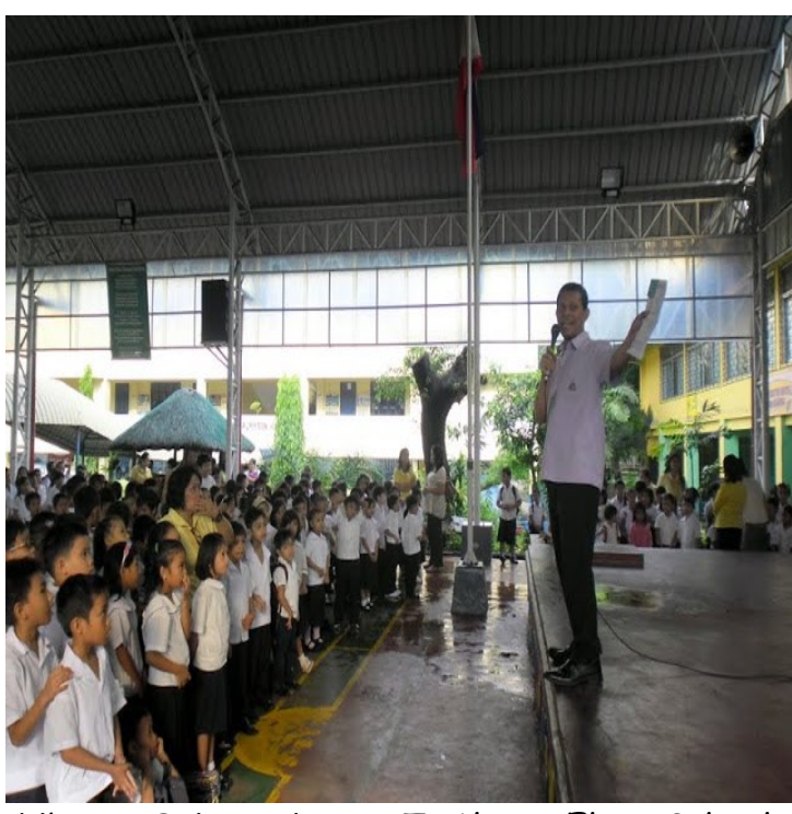
Library Orientation at T. Alonzo Elem. School, Proj. 4