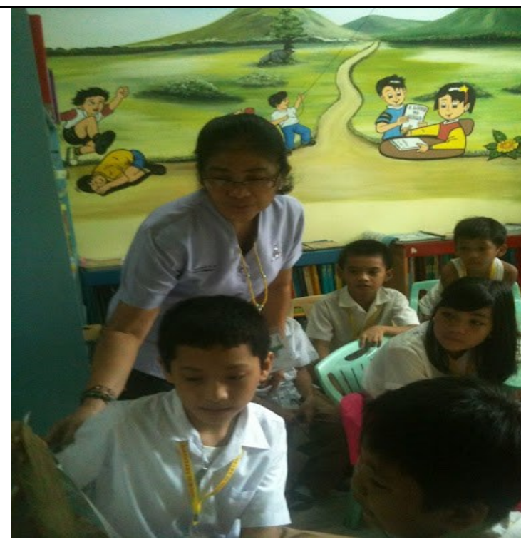
Proj. 7 Branch Storytelling Session