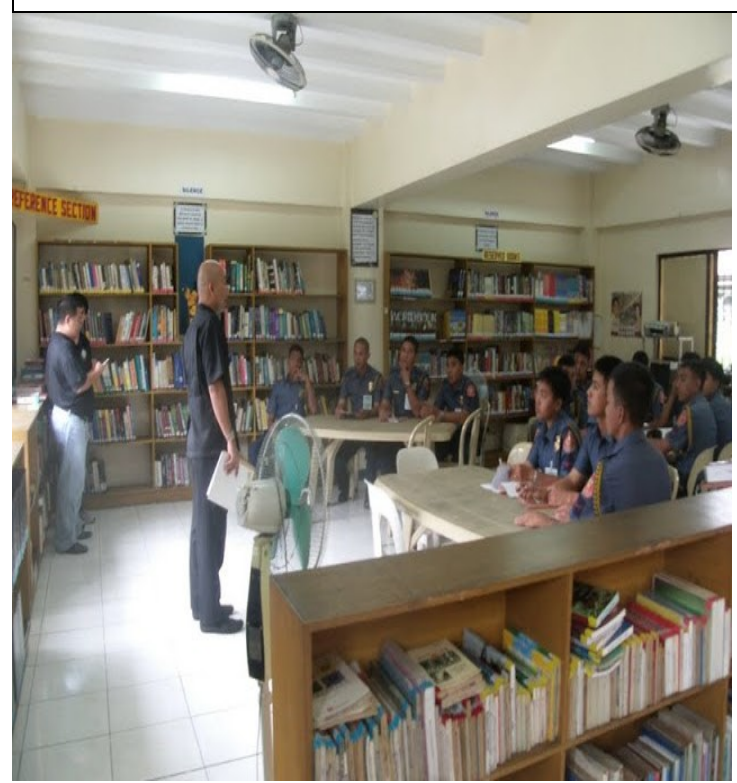
GP4L venue of QCPD Moral & Spiritual Enhancement Seminar Aug. 1, 2012