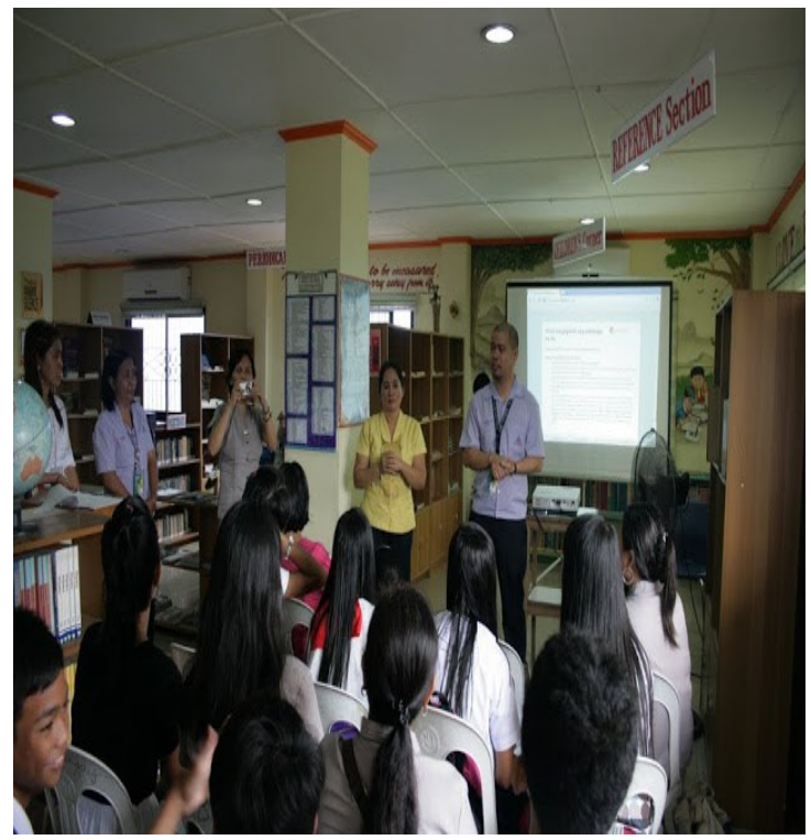
Storytelling for the Deaf at Payatas Branch