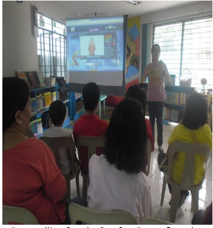
Storytelling for the Deaf at Roxas Branch