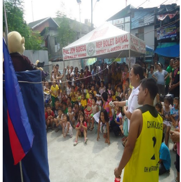
Puppet show at Bgy. Dioquino Zobel, Proj. 4