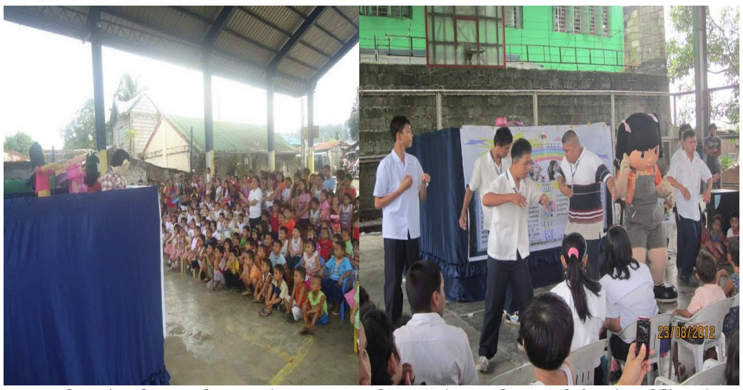
Lupang Pangako, Payatas Puppet Show