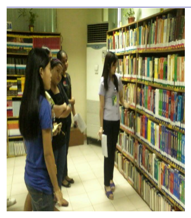
Bestlink Library tour and Orientation at Novaliches Branch Library