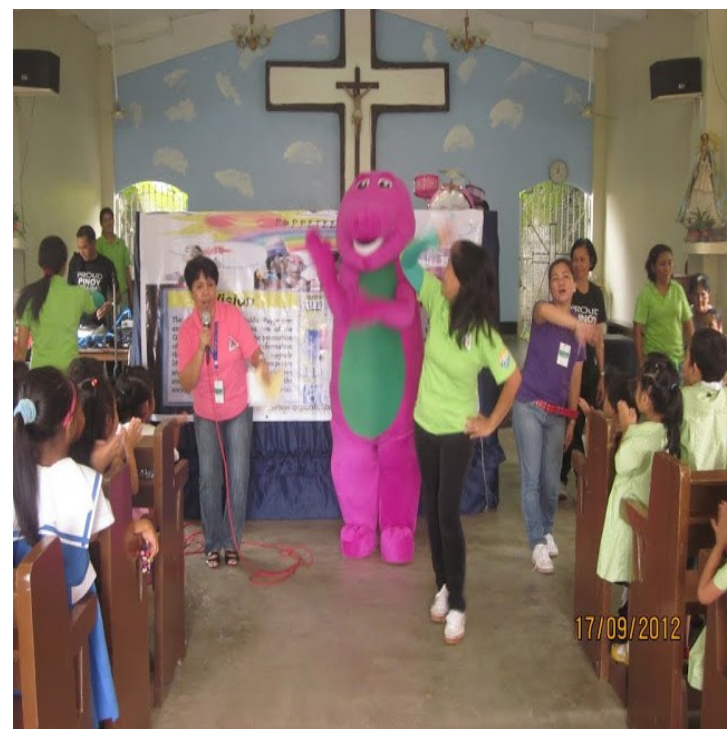
Puppetshow with Barney the Mascot at the Bahay Kubo Library, Payatas.