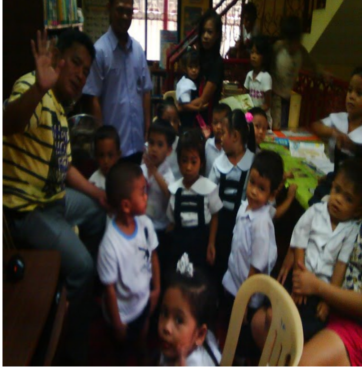
Escopa 2 Branch Library Orientation