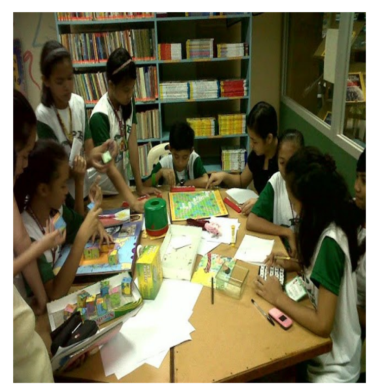
Word Factory and Scrabble Activity at the Children's corner at the Novaliches Branch Library