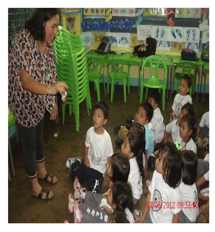
Balingasa Branch Storytelling Session