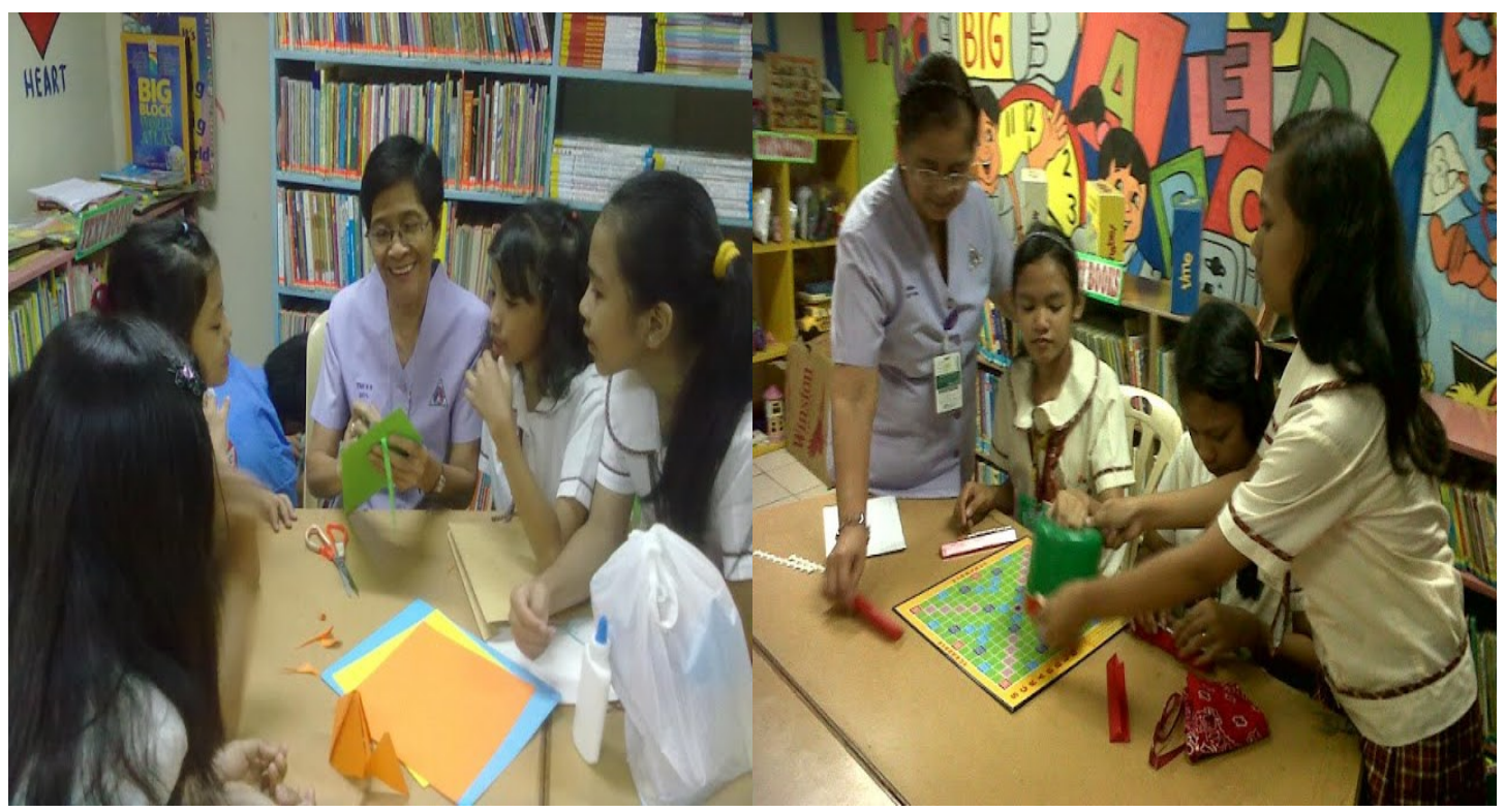
Recreational activities at Novaliches Branch