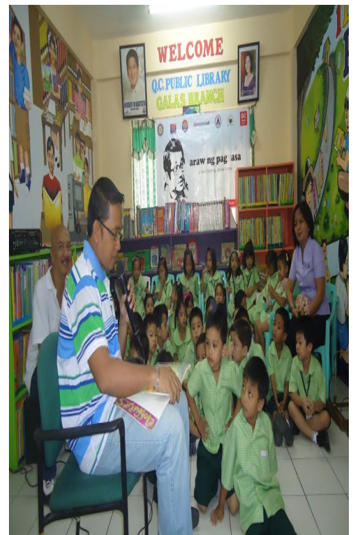
Galas Branch Library