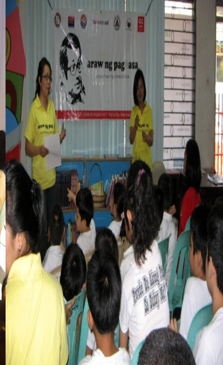
Araw ng Pagbasa at Roxas Branch