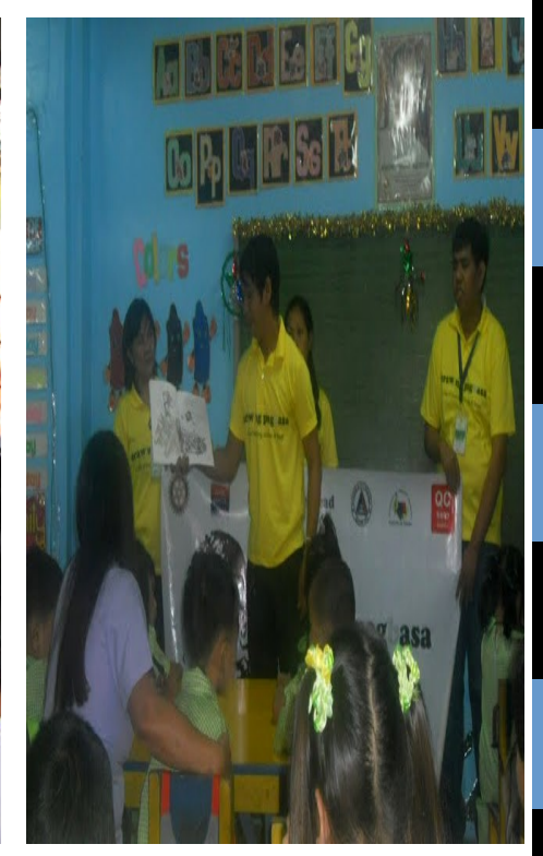
Araw ng Pagbasa at Novaliches Branch