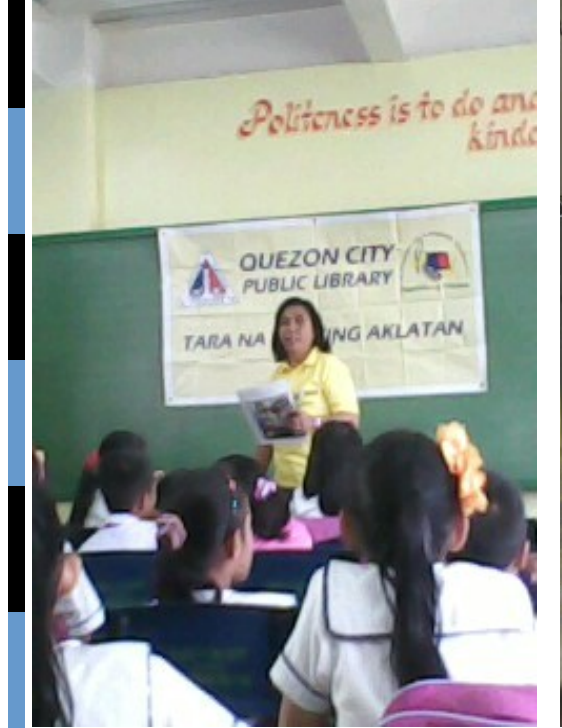
Araw ng Pagbasa at Payatas Branch