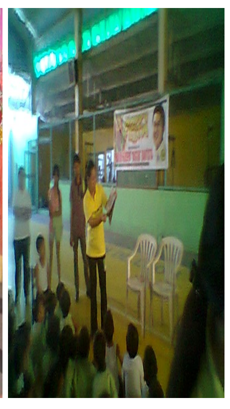
Escopa 3 Branch Library