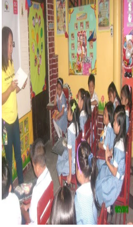
Pasong Tamo Branch Library