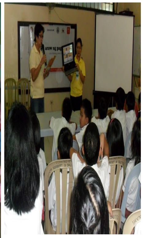
Lagro Branch Library