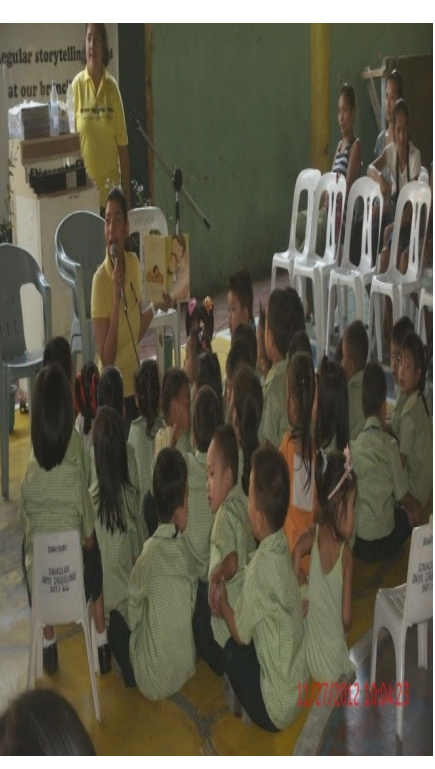
Araw ng Pagbasa at Balingasa Branch Library