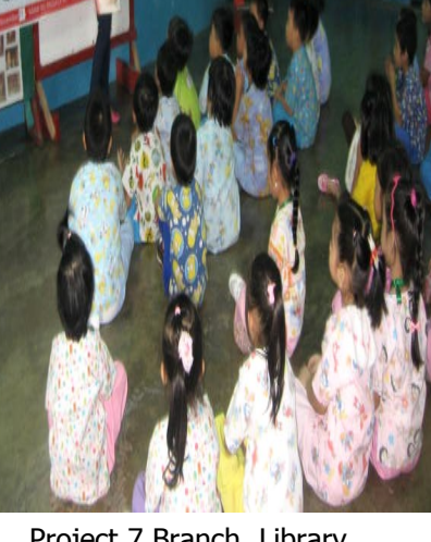
Project 7 Branch Library