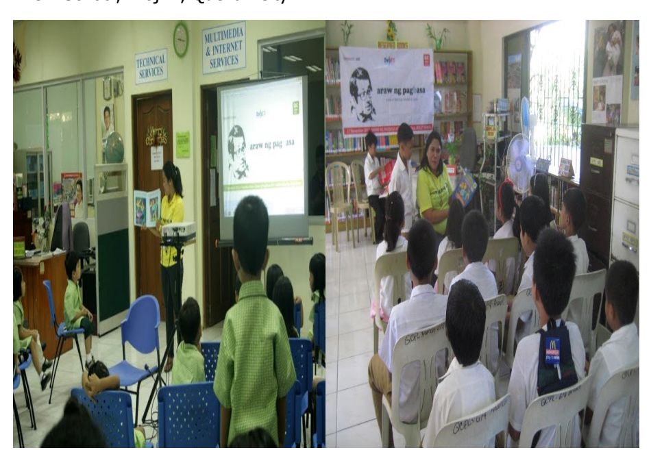
Araw ng Pag-basa at the QCPL Main Library