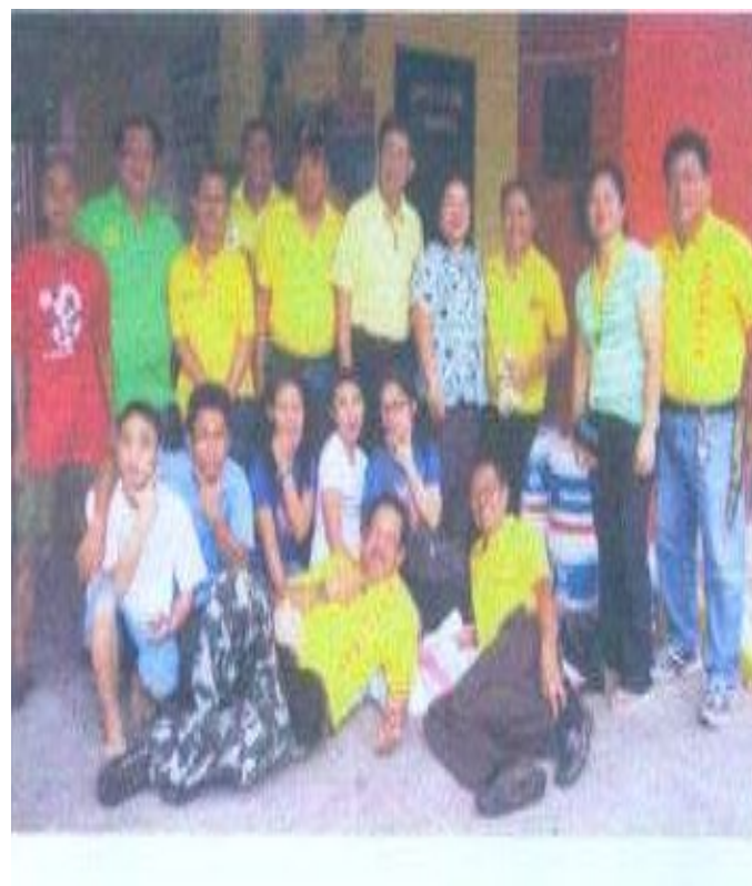
Proj. 7 Library staff together with the Bgy. Veterans and SK Officials, Principal and Teachers of Esteban Abada Elem. school