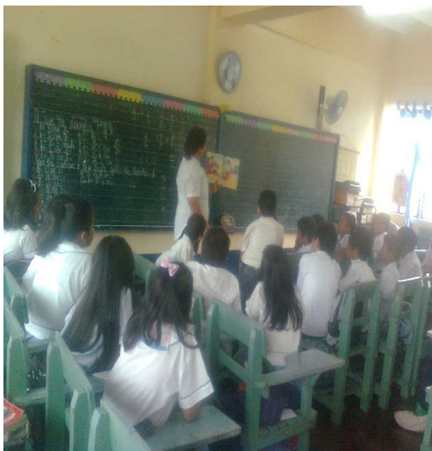
Storytelling at M. H. del Pilar Elementary School