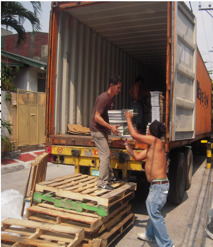
QCPL staff unloads books from the truck to Roxas Branch Library

Nueva Vizcaya, received 1,088 volumes and Tanday Elementary School, Baclayon, Bohol, received 433 volumes.