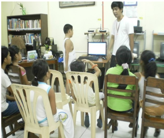
Basic computer training to kids

Training not only to the students but also to the parents will surely be a continuing program of the library.