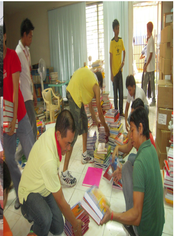
Sorting of books at the Roxas Branch Library