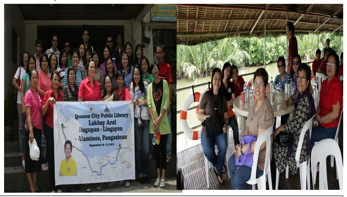
Left: QCPL Staff at Dagupan City Public Library with the librarians. Right: QCPL staff at the Dawel River Cruise,