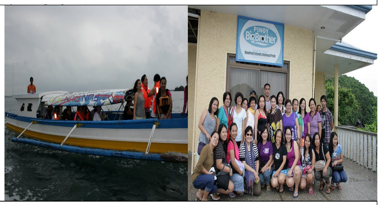
Left: QCPL staff going to Hundred Islands Park. Right: QCPL staff at the Pinoy Big Brother House in Hundred Islands Park.