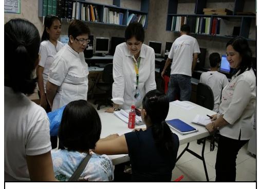
The City Librarian visited the Resources for the Blinds to get insights on how to provide Braille services.

This project is very they need. In the process, we much supported by the Vice will discover that the only difference between us and someone who is blind is that we can see.