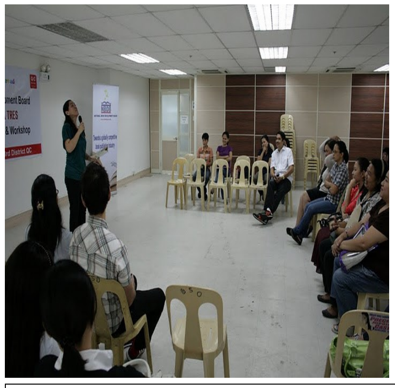
QCPL STAFF and other barangay staff during the Storytelling training and workshop conducted by the NBDB.

The training aimed to give more skills to the QCPL staff who are having their regular storytelling sessions to their respective libraries in the barangays and to others who are also