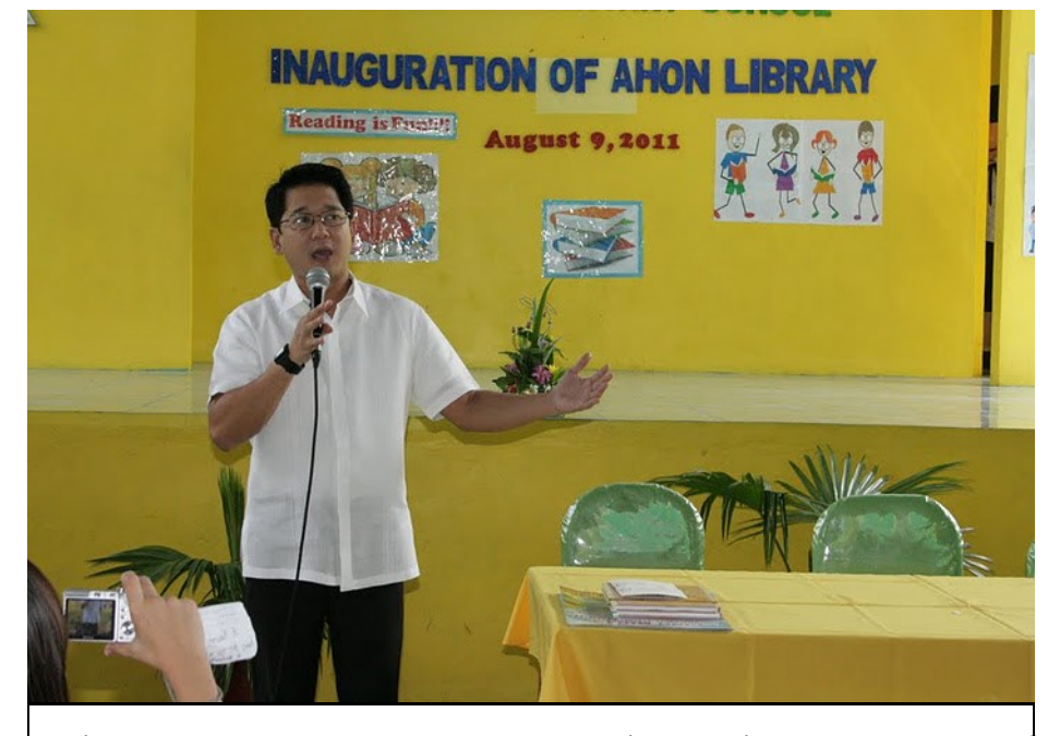
The City Mayor Herbert Bautista during the inauguration of the AHON Library, August 9, 2011.