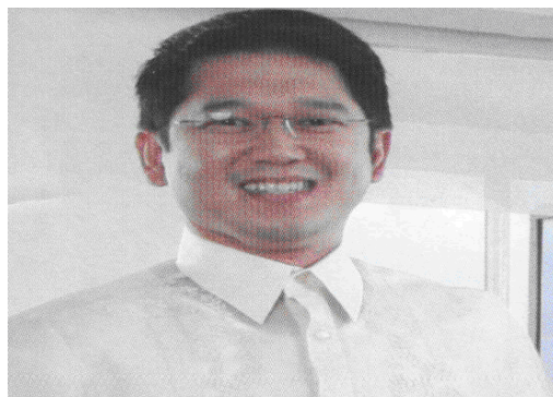
Mayor Herbert Bautista