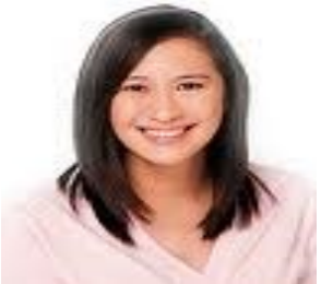
Hon. Joy Belmonte

The Quezon City Public Library has proposed to the City Mayor Herbert Bautista of the Braille Services to serve the visually impaired individuals in the City.