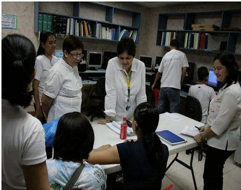
The City Librarian visited the Resources for the Blinds to get insights on how to provide Braille services.

they need. In the process, we will discover that the only difference between us and someone who is blind is that we can see.