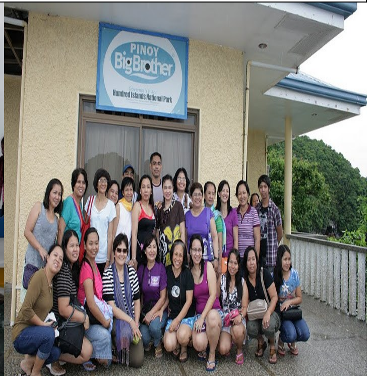
Left: QCPL staff going to Hundred Islands Park. Right: QCPL staff at the Pinoy Big Brother House in Hundred Islands Park.