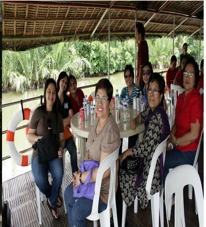
Left: QCPL Staff at Dagupan City Public Library with the librarians. Right: QCPL staff at the Dawel River Cruise,