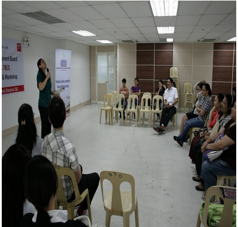
QCPL STAFF and other barangay staff during the Storytelling training and workshop conducted by the NBDB.

The training aimed to give more skills to the QCPL staff who are having their regular storytelling sessions to their respective libraries in the barangays and to others who are also