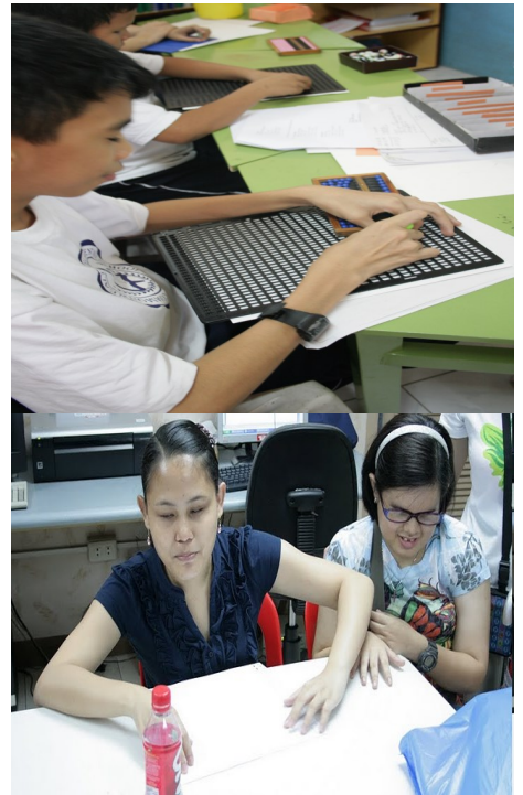
Our proposed clients