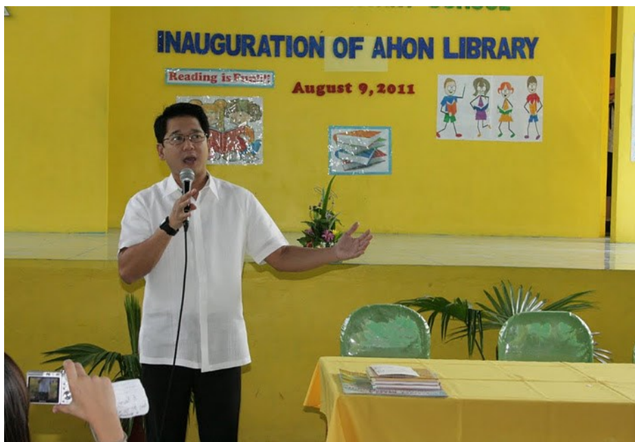
The City Mayor Herbert Bautista during the inauguration of the AHON Library, August 9, 2011.