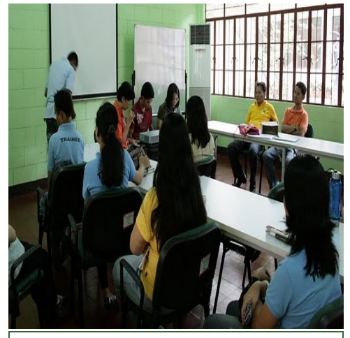
Storytelling conducted by the Escopa II branch to the visually impaired audience.

Job from the Bible through dramatization involving two to three characters. The audience intently listened to the story and after the session, one by one participated in the discussion even tell stories about their lives and how they became visually impaired. They were touched by the story of Job. It is a story of a good man who suffers total disaster- he losses all his children (he had 7 sons and 3 daughters) and property and is afflicted with repulsive disease. But in the end Job is restored to his former condition. with even greater prosperity than before.