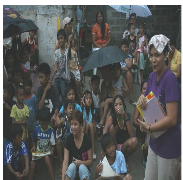
Left: The Organizer's team. Right: Book distribution after the show. (Rain or shine the show must go on)