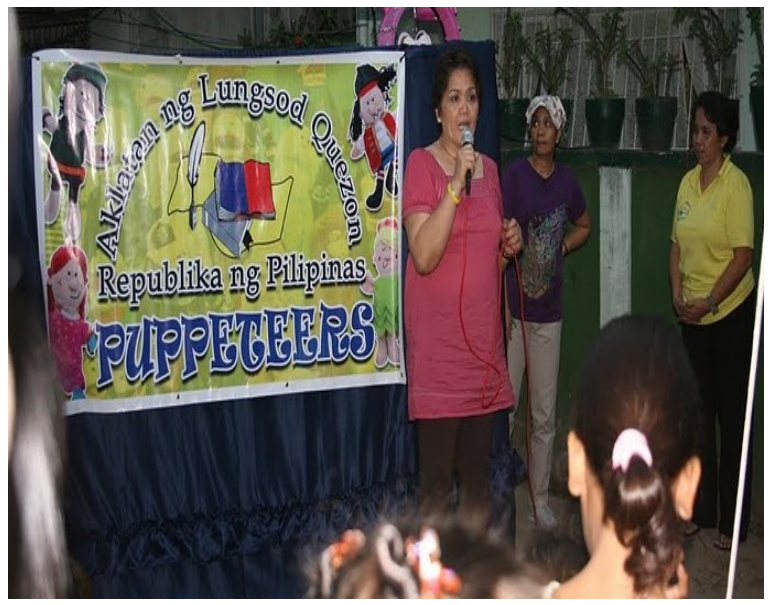
(Left) The house that housed the Mini Library the QCPL organized, (Right) the City Librarian giving an inspirational message. (Below) the audience. (below right) The Puppet Show.