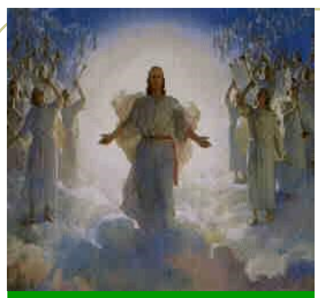
"Someday Jesus Christ will return to this earth in bodily form with the armies of heaven"

He (Jesus) is the image of the invisible God, the firstborn over all creation. For by Him all things were created: things in heaven and on earth, visible and invisible, whether thrones or powers or rulers or authorities; all things were created by Him and for Him." Colossians 1:15