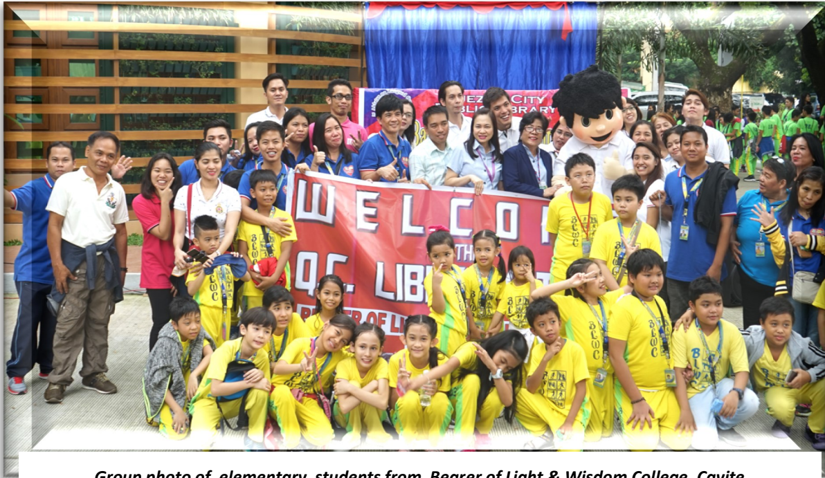
Group photo of elementary students from Bearer of Light & Wisdom College, Cavite together with the QCPL Staff and Puppeteers

The Quezon City Public Library with initial partnership with QC Circle Educational Attractions (QCCEA), made a record with the most number of students/ participants of 450 persons from Bearer Of Light & Wisdom College in one day Library Tour and Orientation with Puppet Show last September 28, 2017. You can really see the fun and excitement of the students, parents and teachers to witness the state of the art QCPL building and much more amazed to the program prepared for them particularly the Puppeteers and Mascot presentation. QCPL is considered a top destination when it comes to public libraries in the Philippines and top ten when it comes to all kinds of libraries in Metro Manila.