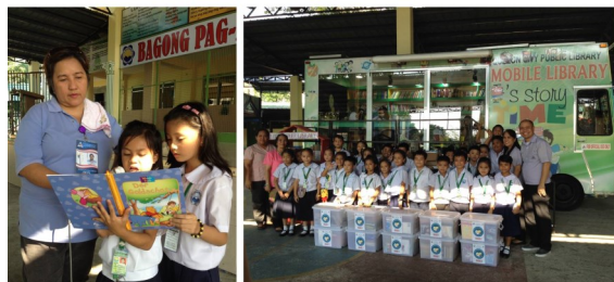
BAGONG PAG-ASA ES, PINOY READING BUDDIES (AUG 7, 2017)