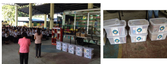
BAGONG PAG-ASA ES, PINOY READING BUDDIES (AUG 7, 2017)