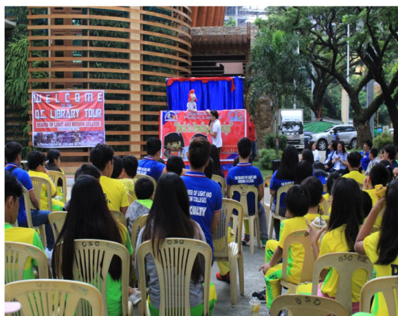
The Puppeteers performing in front of Bearer of Light & Wisdom College students