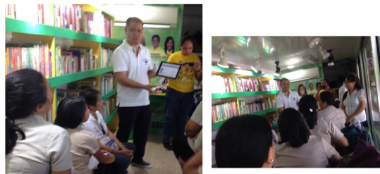
BAGONG PAG-ASA ES, LIBRARY SERVICES ORIENTATION (AUG 10, 2017)