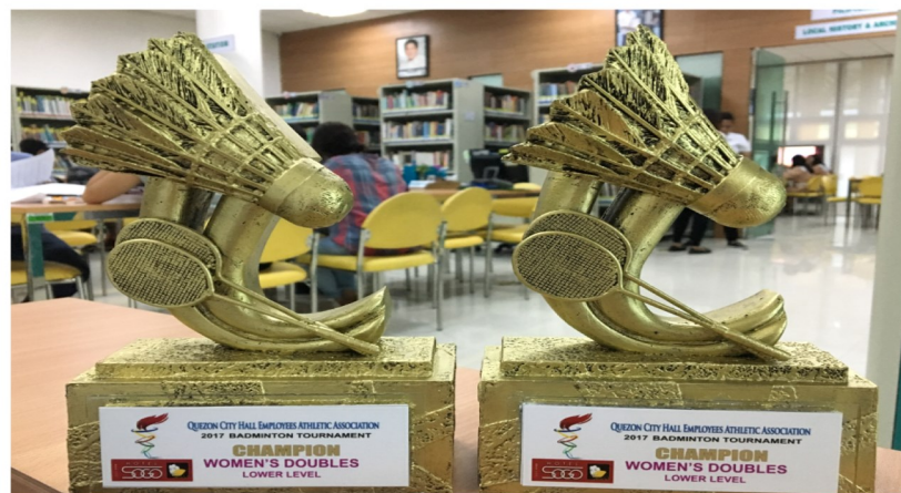
Trophies on the QCHEAA 2017 Badminton Tournament Women's Doubles Lower Level Championship