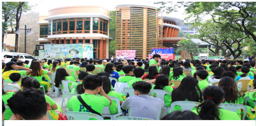
Students, Parents & Teachers of Bearer of Light & Wisdom College, Cavite at the QCPL parking lot where the activity was held

Continuation from page 27...QCPL's Initial (photos)