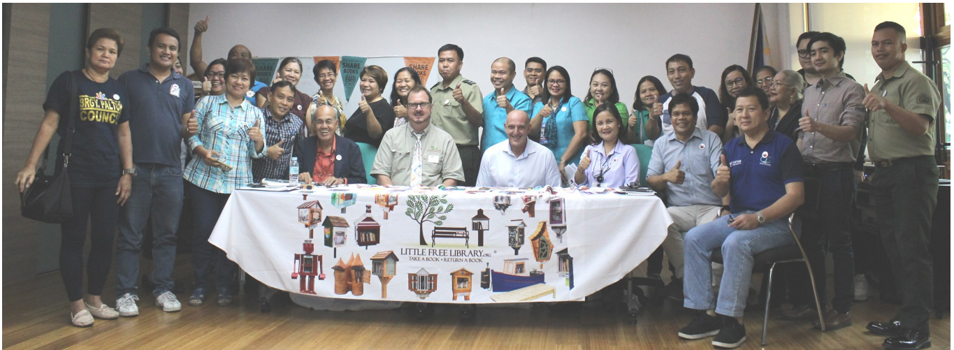
Group photo with the LFL stewards