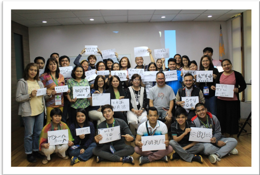
The entire Baybayin seminar participants

Hindi lang sa iba't ibang panig ng mundo may mga naitalang paraan o sistema ng pagsulat. Sa katunayan, may mga liktao o artifacts na nahanap sa Pilipinas na magpapatunay na may sistema na ng pagsulat at pakikipagkomunikasyon ang mga