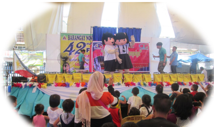
Mascots Lib and Rary at the Novaliches plaza waving to children and parents before a dance number