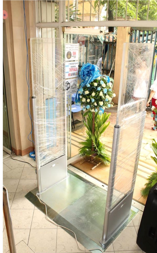
The RFID panel of Novaliches branch