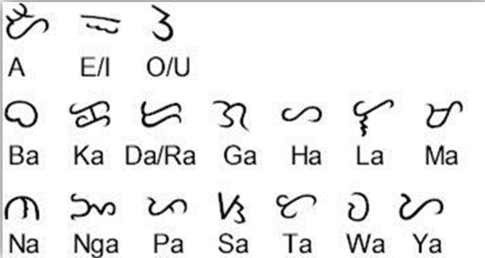
Itsura ng pagsulat sa Baybayin

Ang mga liktaong ito ay ilan lamang sa patunay na mayroon ng sistema ng pagsulat at pakikipagkomunikasyon ang mga katutubong Pilipino bago pa man dumating ang mga Kastila.