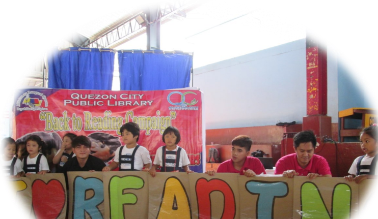
Children from various elementary schools interactively joining the puppeteers in holding the banner "I Love Reading"

The objectives of these activities are to entertain the audience and to encourage the children to return back to reading. Thus, the "Back to Reading" campaign of QCPL.