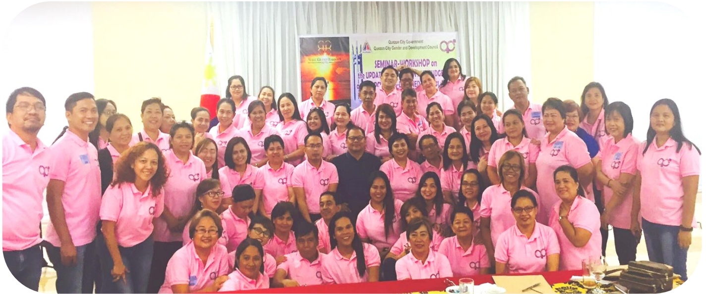
GAD Focal persons participants

The Quezon City Gender and Development (GAD) Council together with the GAD Technical Working Group, conducted a Seminar/Workshop on the Joint Memorandum Circular 2016-01, which is the “Amendments to PCW-DILG-DBM-NEDA JMC No. 2013-01: Guidelines on the Localization of the Magna Carta of Women” last August 16-18, 2017 held at the Subic Grand Harbour Hotel in Subic, Olongapo City.