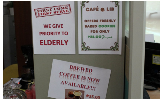
Inside the Periodical section Café@Lib extension