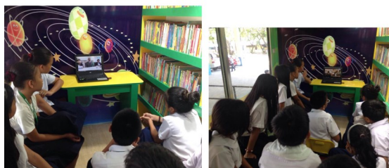
BAGONG PAG-ASA ES, MEDIA LITERACY SEMINAR (AUG 9, 2017)