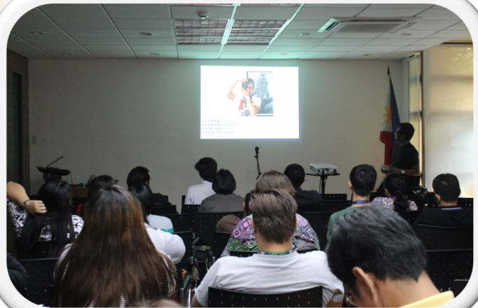
Basic Photography seminar proper