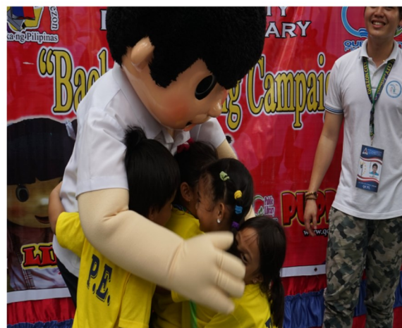
Mascot "Rary" hugging Elementary students of Bearer of Light & Wisdom College after his performance