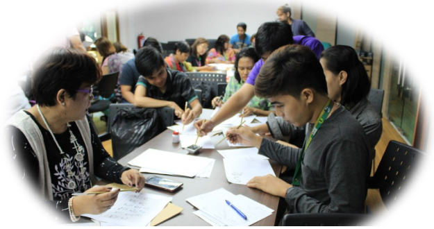
Ang mga kalahok sa seminar-workshop habang ginagawa ang kanilang pagsalalin ng kanilang sariling pangalan sa Baybayin