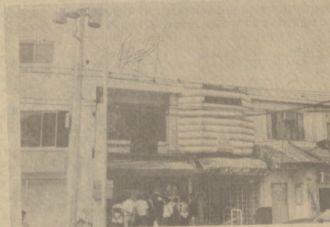
The facade of the Ozone Disco was undamaged.

The merry-makers clapped thinking the sparks were fireworks but the terrible truth stunned them when they saw the raging flames and the thick, swirling smoke. Panic and chaos ensued. Screaming, they stampeded to the entrance door. Alas! it was a swing-in door (contrary to fire safety rules). The tendency of the Ozone patrons fleeing the fire was to push the door outward instead of pulling it inward. Trapped, they tumbled over each other and got incinerated. As high as eight layers of charred bodies were piled up.