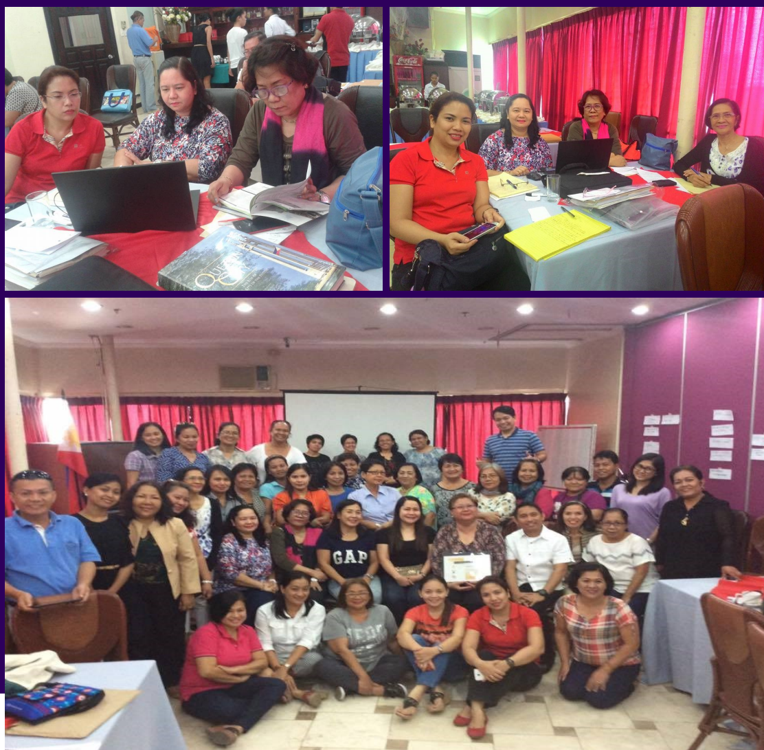
Participants on Writeshop, Proofreading and Layouting

The training-workshop was attended by almost fifty librarians from the different cities in the Philippines. Participation in these trainings will result in the inclusion of our City in the publication of this new Historical Data material.