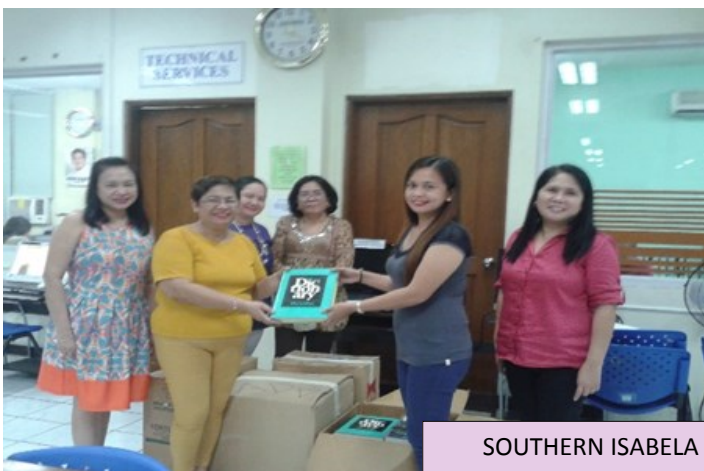
SOUTHERN ISABELA COLLEGE OF ARTS AND TRADE