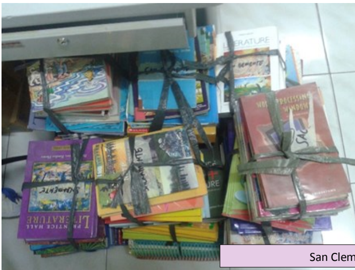
San Clemente Municipal Library