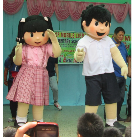
Mascots Lib and Rary during a puppet show as well as the various hand puppets used by the QCLIC Puppeteers

Primarily a form of visual art, Puppetry can be used to express ideas in a simplified manner that is easy to understand and enables the puppeteer to communicate to people who are not literate or those who have difficulty understanding foreign languages; thus, making puppet shows an effective way of teaching children.