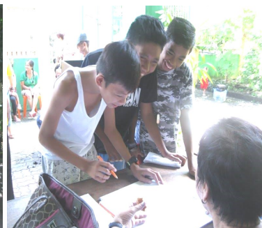
Community residents of who availed of the “Back to School Gupitan” getting a haircut including of District I Librarians