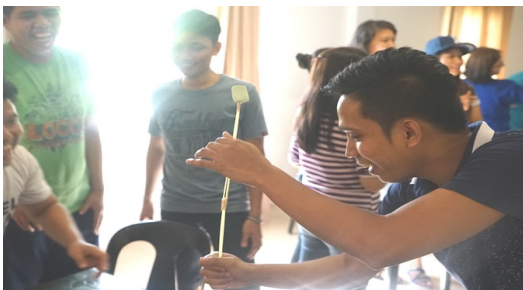
Photos taken during the QCLIC Teambuilding activities as well as the awarding ceremony