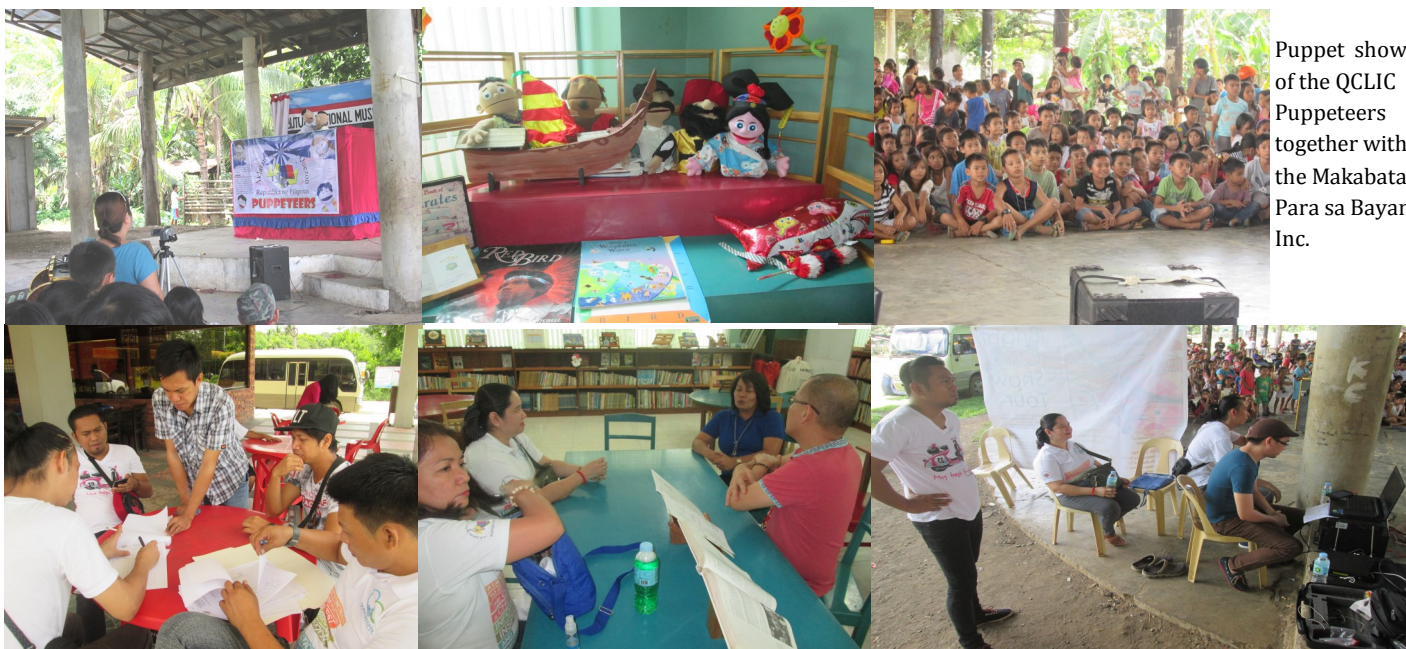
Puppet show of the QCLIC Puppeteers together with the Makabata Para sa Bayan, Inc.

They believe that our library, the QCLIC, has achieved a lot and is continually introducing new innovations one of which is through puppet and mascot shows, in the promotion of books and other learning devices to bring back the younger generation to the very basic way of learning which is reading books. By doing this, we are hoping that we can encourage even more children to strengthen their love for reading despite the presence of modern technology.