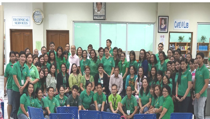
Group picture of the QCLIC Personnel with the Guest Lecturer

The topic of the seminar emphasized that as librarians we have to seek to redefine ourselves. The model of embedded librarianship is generating interest as an effective means of applying the knowledge and skills of librarians towards the information challenges of the digital age. Embedded librarianship takes a librarian out of the context of the traditional library and places him or her in an “on-site” setting or situation that enables close coordination and collaboration with the community.