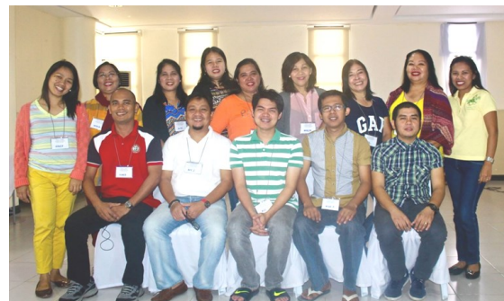
Library Officers of the Association of Librarians in Public Sector (ALPS), Inc. and Star Librarians in Bacolod and Davao City Library