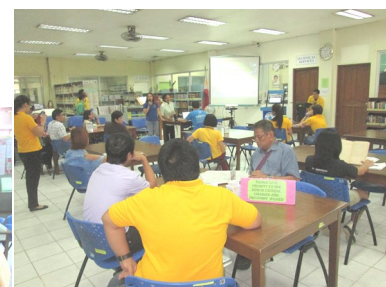
Above: QCLIC Librarians and staff being briefed about the STARBOOKS program