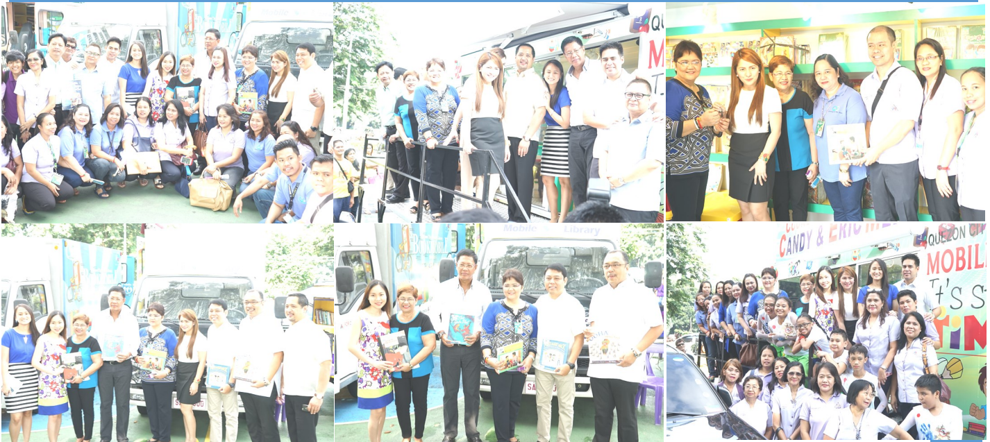
More photographs from the simultaneous launching of the six mobile libraries