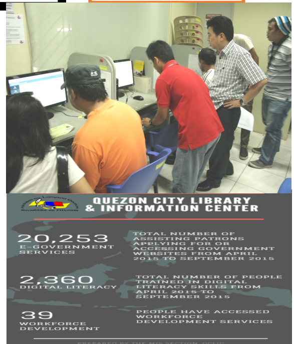
Figure 1: MIS Infographics for customers served

The e-government service of the QCLIC is open as early as 7:30 in the morning from Monday to Friday, serving an average of more or less 200 customers every day.