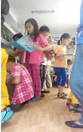
Children browsing books in the Book Mobile