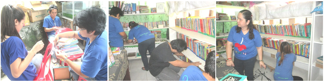
QCLIC Outreach and Technical Services staff labeling and organizing books at the BJMP library