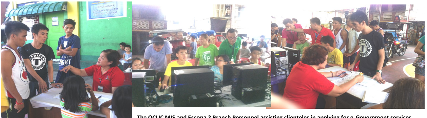
The QCLIC MIS and Escopa 2 Branch Personnel assisting clientele in applying for e-Government services

Continuation from Page 12... Book Mobile of Coun. Medina