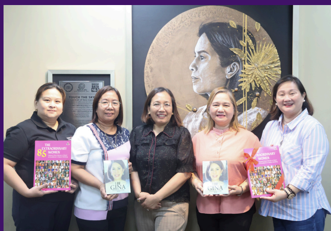
ABS-CBN Foundation, Inc. on behalf of Ms. Gina Lopez, former Secretary of DENR

The featured award-winning women who received the book in this quarter were the following: