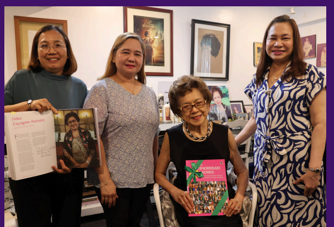
National Artist Fides Cuyugan-Asensio The Grand Dame of the Philippine Stage