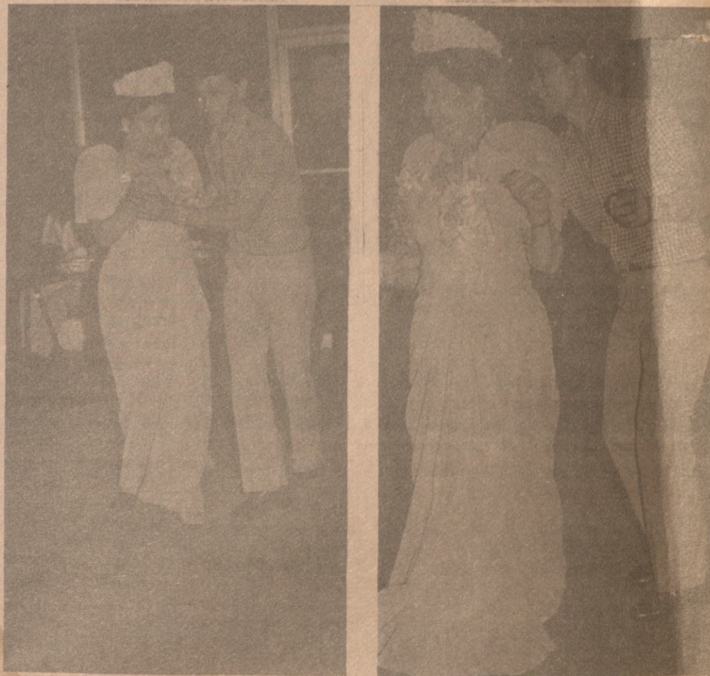
The Mayor dances the tango