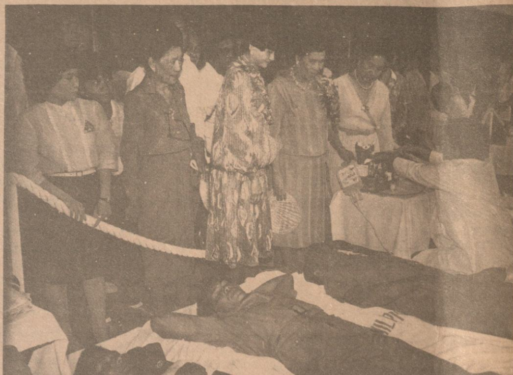
Blood-letting at the QC Hall lobby