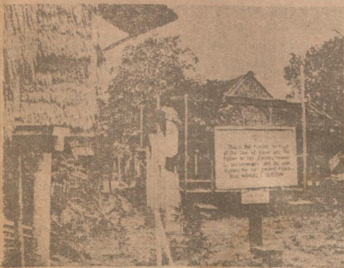
This is the humble hut where the "Star of Baler" was born. It is the root of his lifelong obsession for the upliftment of the poor.